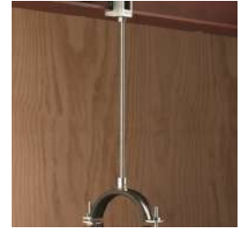
Universal beam clamp for standard beams